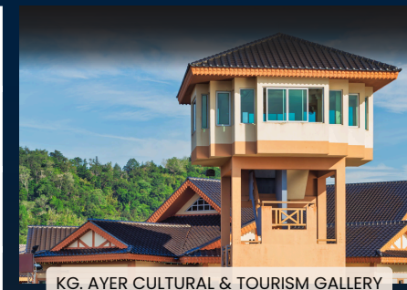
KG. AYER CULTURAL & TOURISM GALLERY